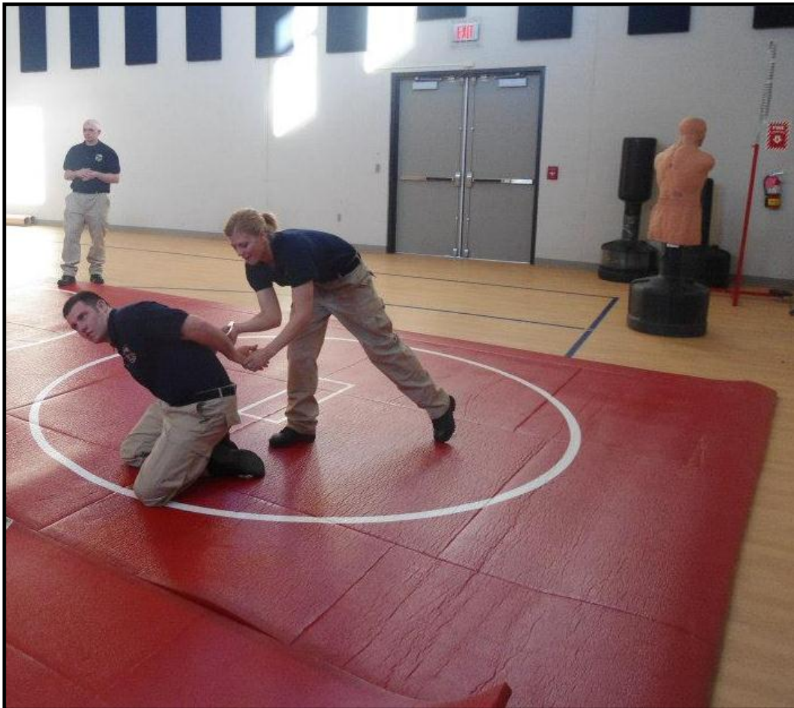
Students from the 152 nd Session of the Basic Officers Certification Course.

Note: One office did not report this information.