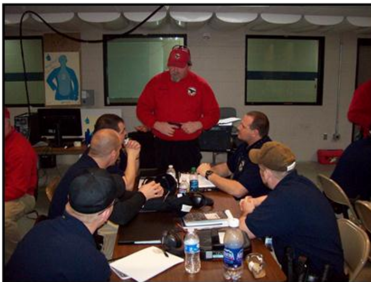
Students from the 149 th Session of the Basic Officers Certification Course held February 26, 2012 through May 24, 2012 receiving instruction in the indoor firearms range at D.C.I.

Key: F = Office pays in full. P = Office pays partial. - = Office does not pay.